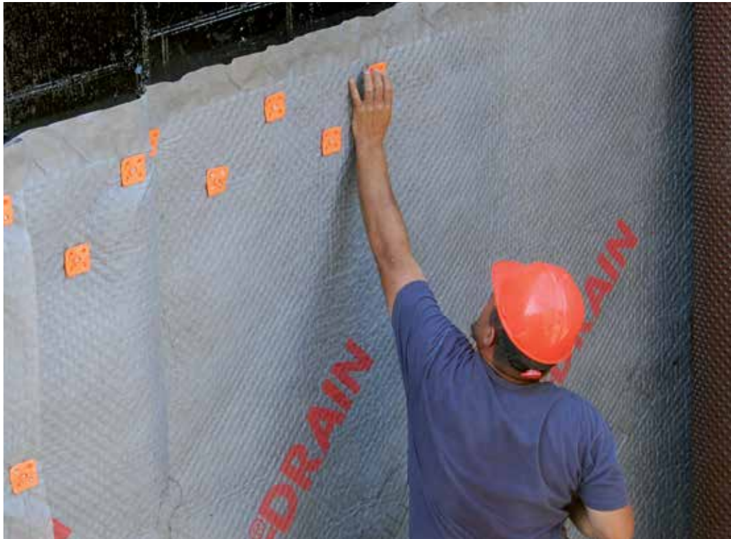
DELTA®-FAST'ners hold DELTA®-DRAIN tightly to foundation wall.