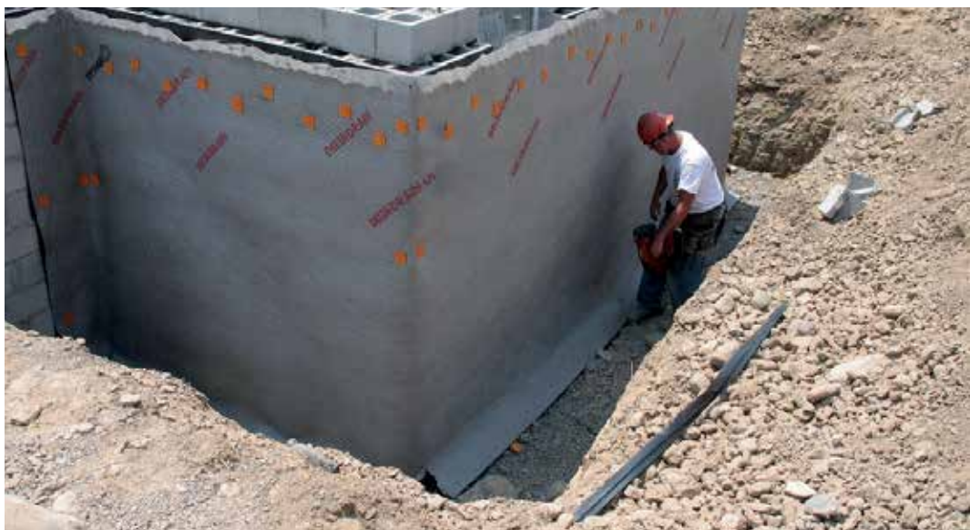
Bend DELTA®-DRAIN at footing to drain water away from cold joint.