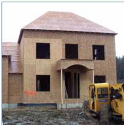
Before Enviro-Dri Weather-Resistant Barrier System