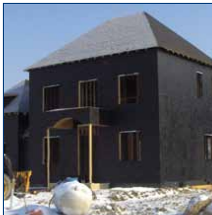
After Enviro-Dri Weather-Resistant Barrier System